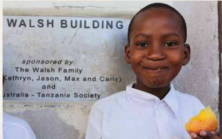
standing outside The Walsh Building, one of many donations by the Walsh family

Through the Australia Tanzania Society donations are raised to build waterwells, classrooms and supply under-resourced Tanzanian Schools with learning materials like textbooks, chairs and desks.