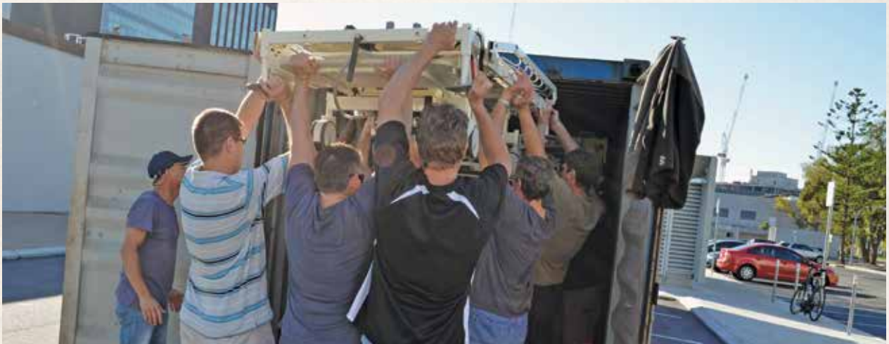
many hands make light work