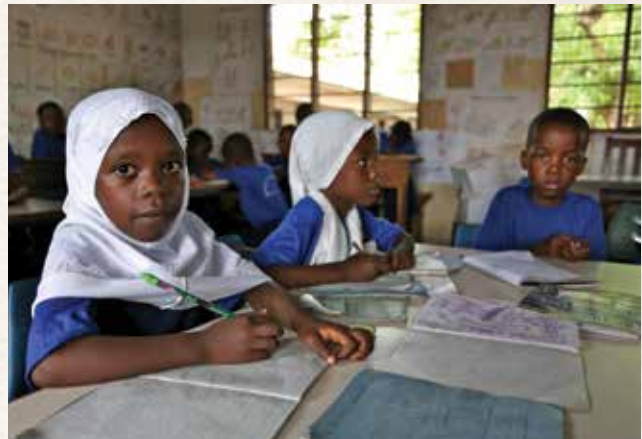
children using donated chairs and desks at Moringe Primary School

Most Tanzanian schools face extreme shortages in textbooks, desks, chairs, toilets, water supply, and hand-washing facilities.