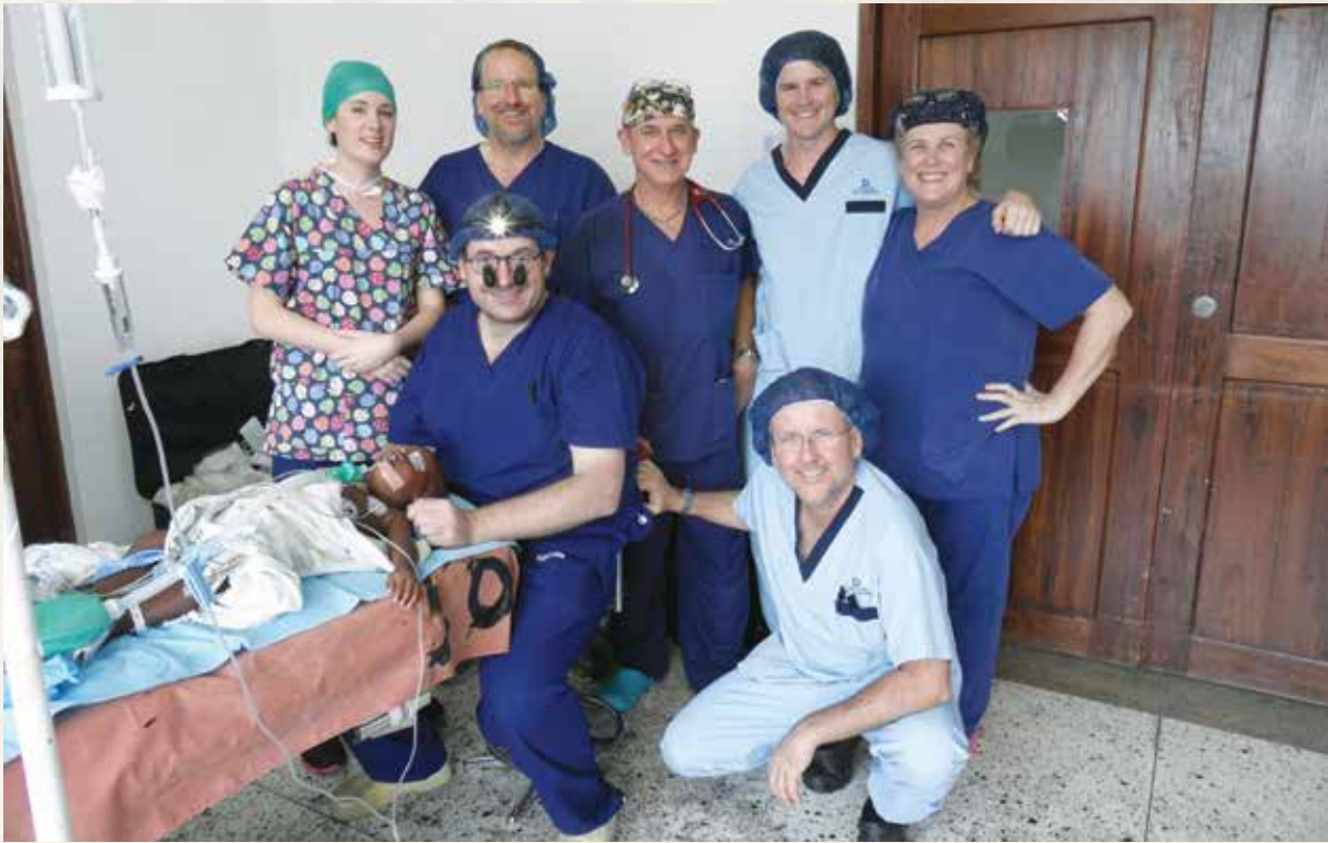
our teams looking good, in and out of surgery