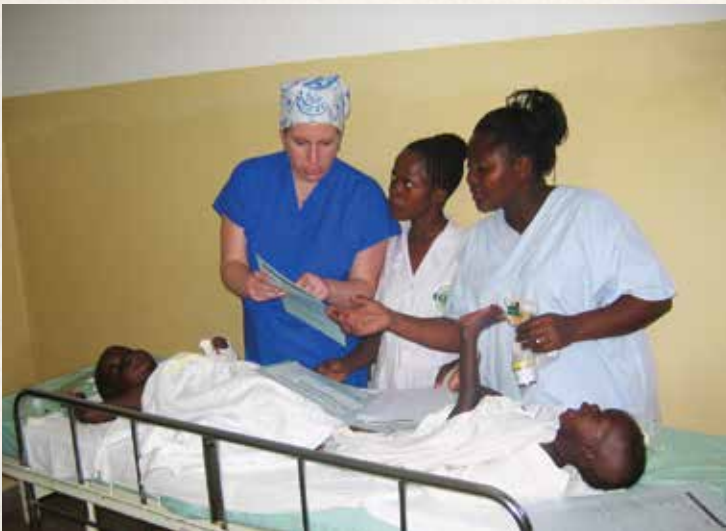
showing local nurses the recovery notes