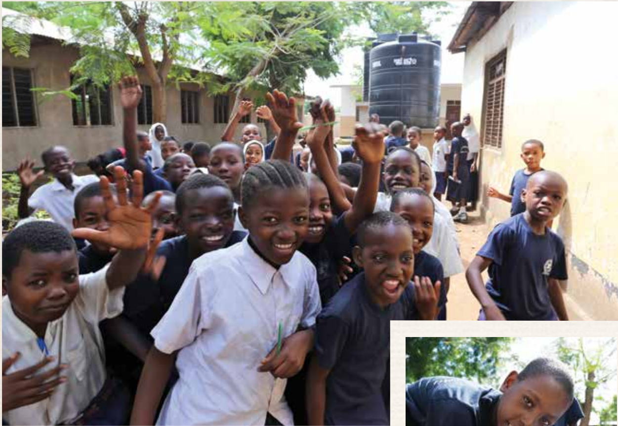
primary school children in front of a donated water well at Buza Primary School

We've drilled 17 waterwells and counting. We've also provided clean water for three more schools where we have rehabilitated their water supply.