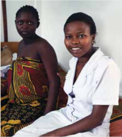
a nurse and a patient at Sinza Health Centre using a bed sent from Australia