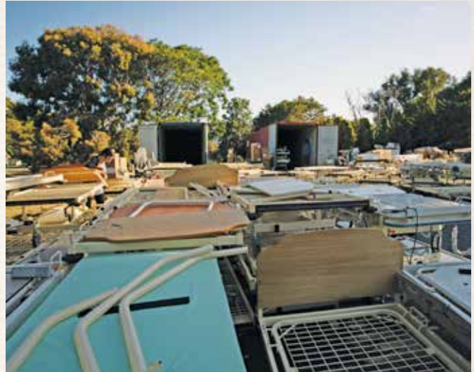
medical equipment in Perth ready to be packed

In addition to the surgeries and training, Rafiki also sends shipping containers of medical equipment to Tanzania that would otherwise go to waste in Australia. Since 2010, we have packed and shipped more than 30 containers for distribution to hospitals and medical centers. The replacement cost of this equipment exceeds $7,000,000.