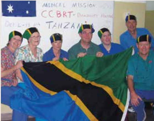
the team in the early days at CCBRT