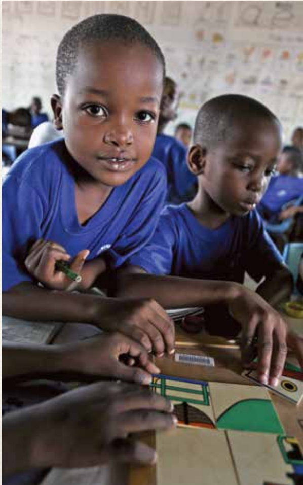
pre-primary school children with donated resources at Moringe Primary School