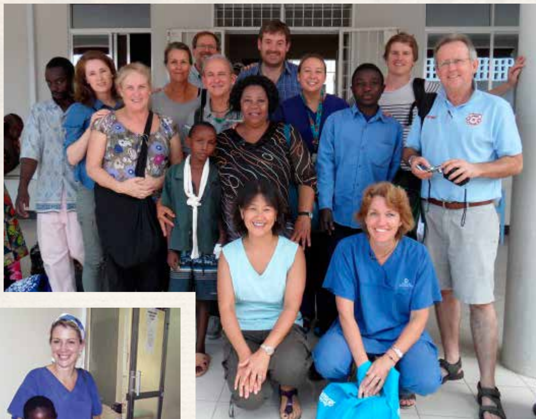
the team at Sekou Toure Hospital, Mwanza