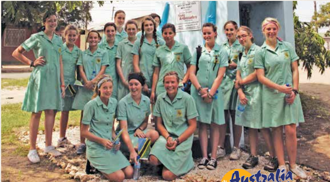
Penrhos students at Wailes Secondary School in 2008

Additionally, ATYA has provided Tanzanian Curriculum text books, to assist in the delivery of quality education, and has facilitated and funded several professional development courses for Tanzanian teachers.