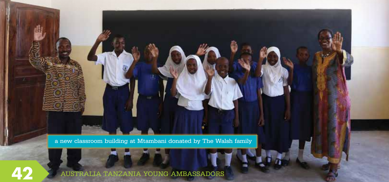
a new classroom building at Mtambani donated by The Walsh family