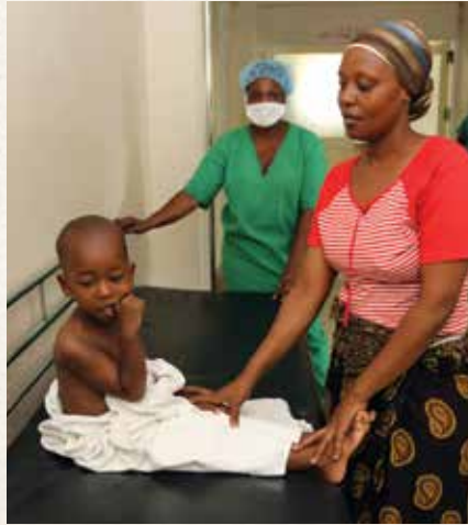
ready for surgery on a donated bed at Mission Mikocheni Hospital

The medical equipment is treasured in Tanzania and is being put to good use.