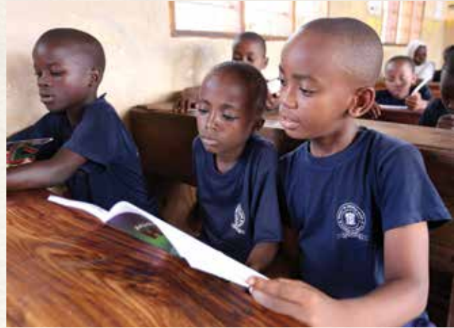
text books donated by Australia Tanzania Society