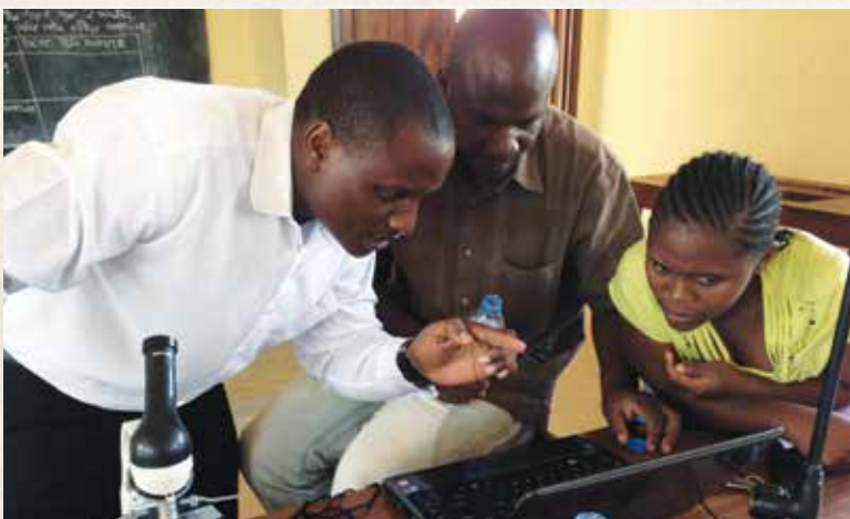
science teachers from Geita implementing thier new skills

In May 2014, three Tanzanian teachers were brought to Perth to spend six weeks in Western Australian Schools to further their professional development. These teachers are passing on their newly acquired skills and knowledge to other teachers in Tanzania.