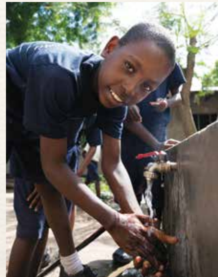
enjoying clean water at Buza Primary School

We've drilled 17 waterwells and counting. We've also provided clean water for three more schools where we have rehabilitated their water supply.