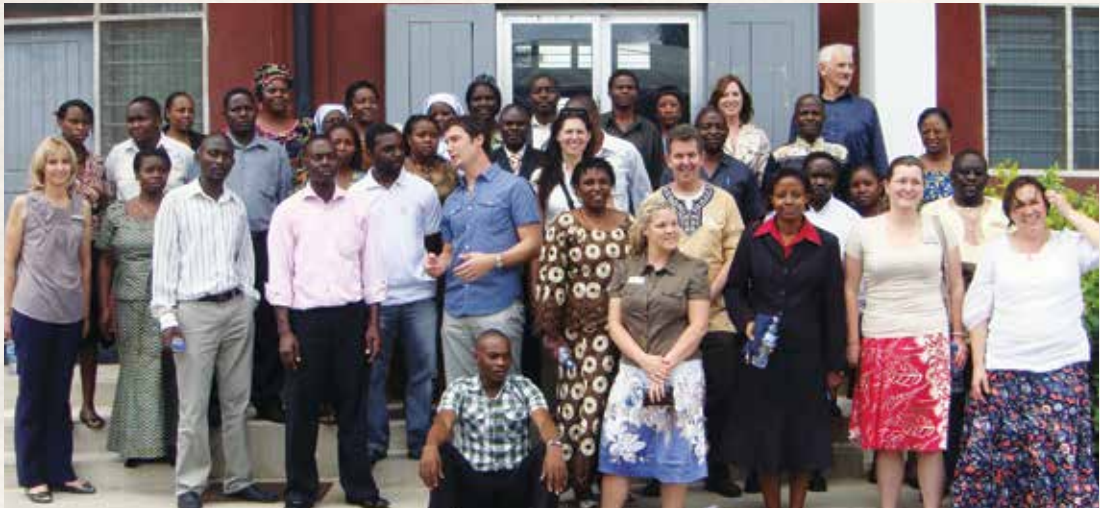
the first professional development conference in 2011